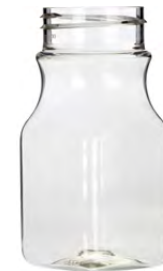
4 oz French Square