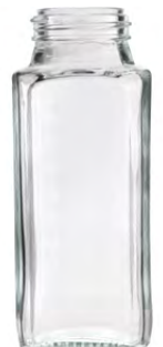
8 oz Square