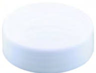
Plastic Smooth Many colors available