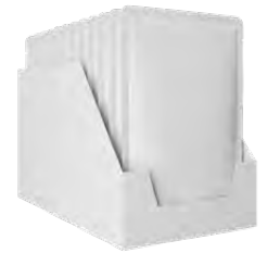
Seasoning Packets with display box