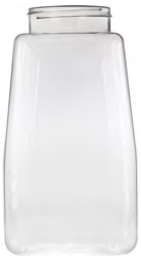
32 oz PET Tapered