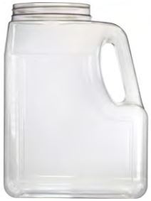
172 oz PET Handled

Here is just a sample of the many bottles we offer that are suited for foodservice packaging.