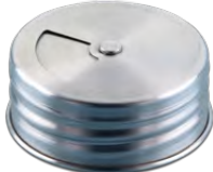
Stainless Steel Multi aperture