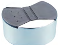
Transparent Dual Flap Many colors available