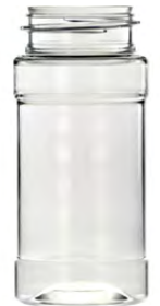
4 oz Round