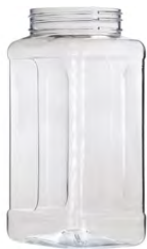
21 oz PET Gripped