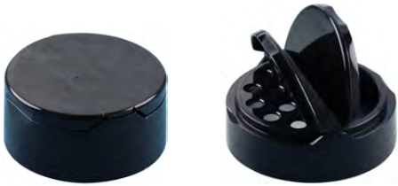
Plastic Dual Flap Many colors available

Here is just a sample of the many lids we offer.