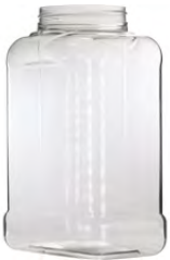
35 oz PET Rectangle