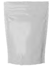
Pouches Printable standup & lay flat