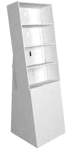
Corrugate Folding Shipper