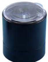
Black Textured With transparent cap