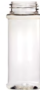
5.5 oz Round