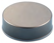
Aluminum With plastic insert