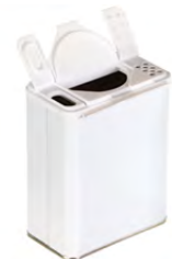
Spice Tins assorted sizes