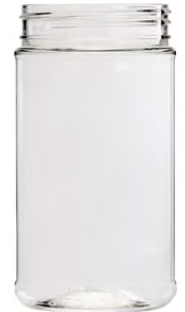
12 oz Round